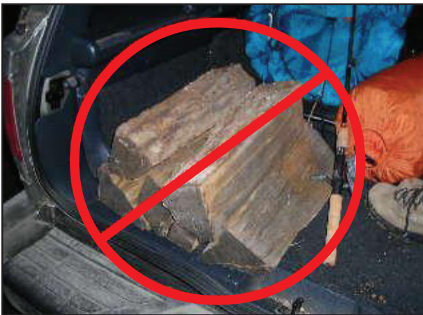
Emerald ash borer is spread to new areas by infested firewood.