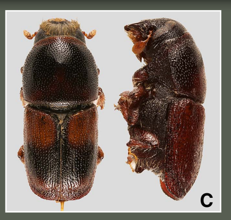
Figure 1. The three species of bark beetle found in North Dakota that spread DED: (A) native elm bark beetle — Hylurgopinus rufipes , (B) smaller European elm bark beetle — Scolytus multistriatus and (C) banded elm bark beetle — Scolytus schevyrewi .